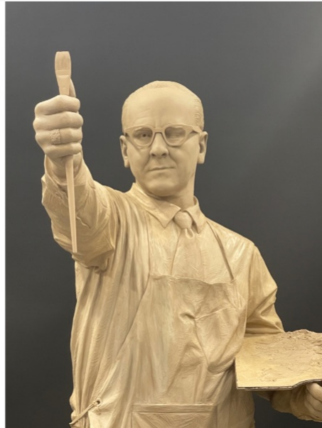
Medium close-up of the Dr Peck Memorial figure in Clay