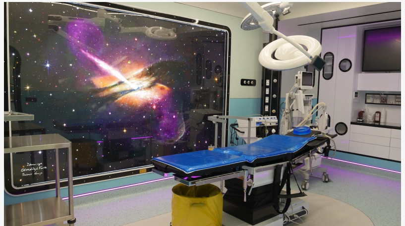
KEIT Day Hospital

The clinic prides itself on its comprehensive suite of breast surgeries, offering solutions that cater to diverse needs – from augmentation to reduction and lifting. Patients seeking a transformation that is both subtle and striking find solace in the hands of these skilled practitioners. Breast augmentation is an art form at KEIT, where surgeons guide patients through a myriad of choices to achieve the perfect harmony. One of the distinguishing features of the clinic is the array of implant options available. KEIT boasts an impressive selection of implants, each carefully curated to meet the diverse needs and desires of its patients. The choices are as vast as they are innovative. KEIT sets itself apart by providing personalized consultations, allowing patients to make informed decisions based on their unique anatomy,