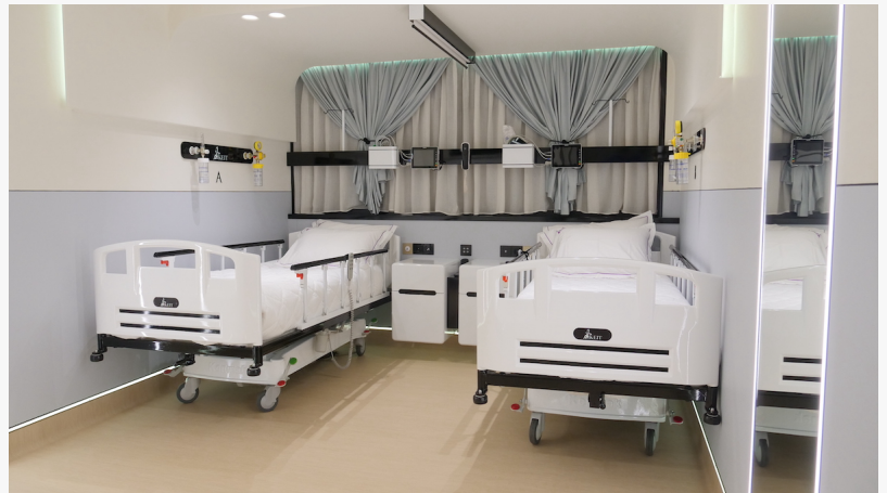
Keit Day Hospital Rooms