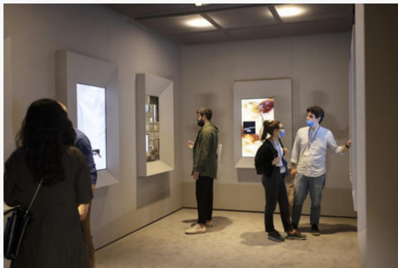
European Cultural Centre, Italy