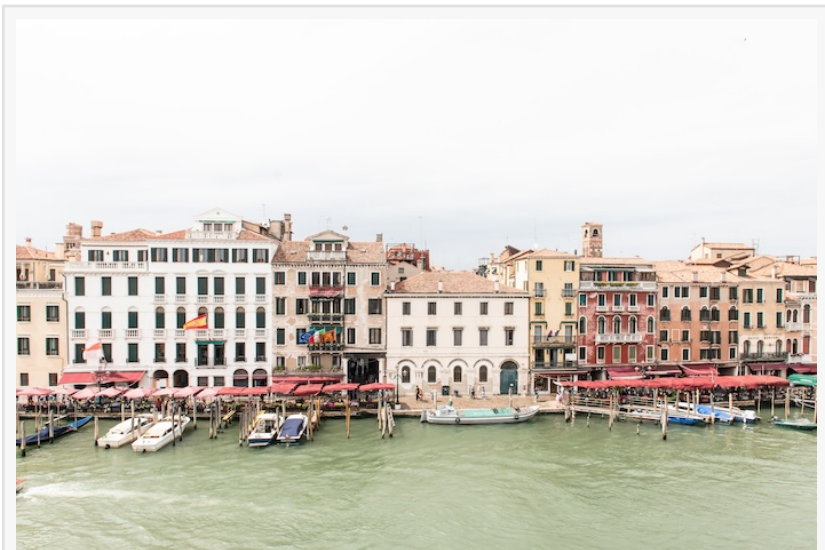
Palazzo Bembo view from the Grand Canal