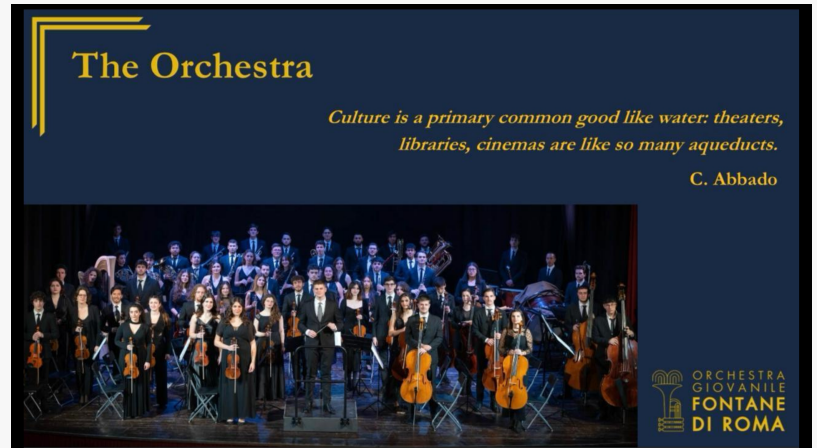
Fontane di Roma Youth Orchestra in Dubai

Fontane di Roma is made up of young musicians, trained in the most accredited Italian academies and winners of important international competitions. It was born from the desire to create a space, run exclusively by young people, where they can grow by making music together. The startup's primary mission is to engage the new generation and the wider public with a form of music that is often perceived as remote or challenging to appreciate. By leveraging the authenticity and energy