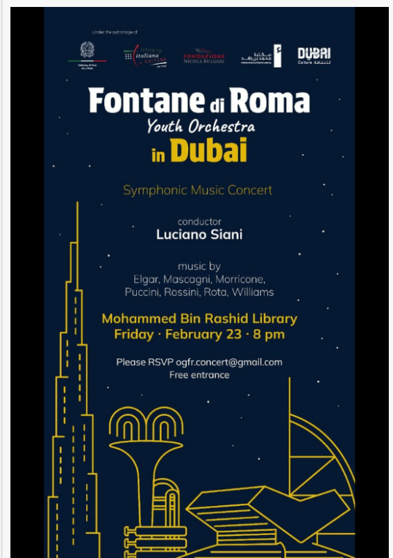
Fontane di Roma Youth Orchestra Concert