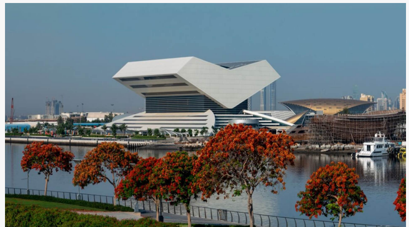
Mohammed bin Rashid Library