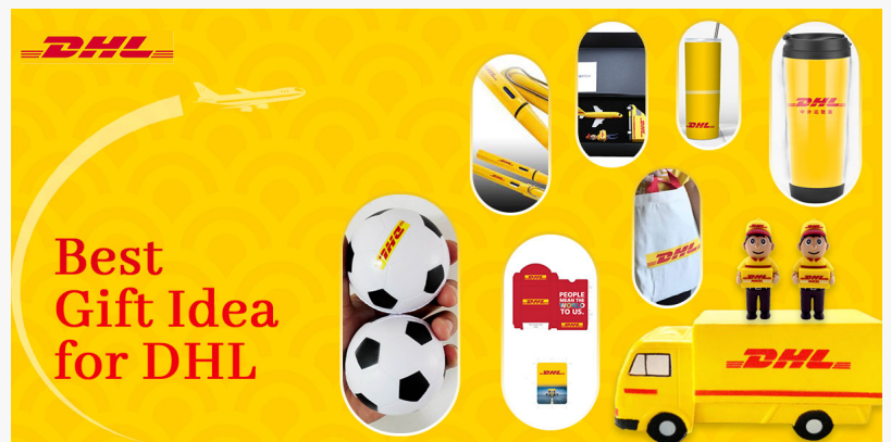
Elevate Your Brand with Thoughtful Corporate Promotional Gifts