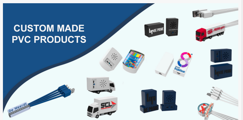
Innovative tech gifts customized to showcase your brand's identity