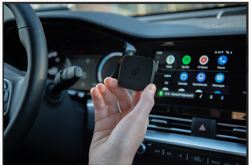
AAWireless adapter enables one to connect wirelessly and automatically to Android Auto

The AAWireless adapter builds a wireless bridge between the phone and the infotainment system. This small adapter plugs into the USB port, as normally done with the phone. From that