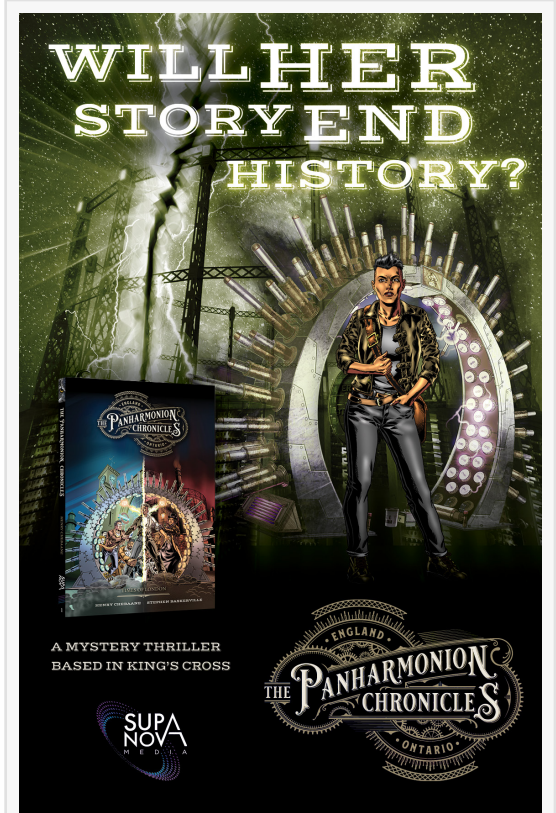
The Panharmonion Chronicles book cover

“An explosion of science fiction and steampunk splendour.” SCIFI NOW