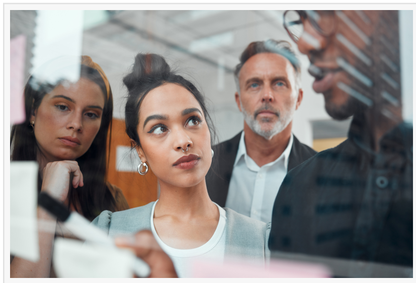
COSMarketing Agency Helps Utilize LinkedIn

messaging that resonates with the target audience.