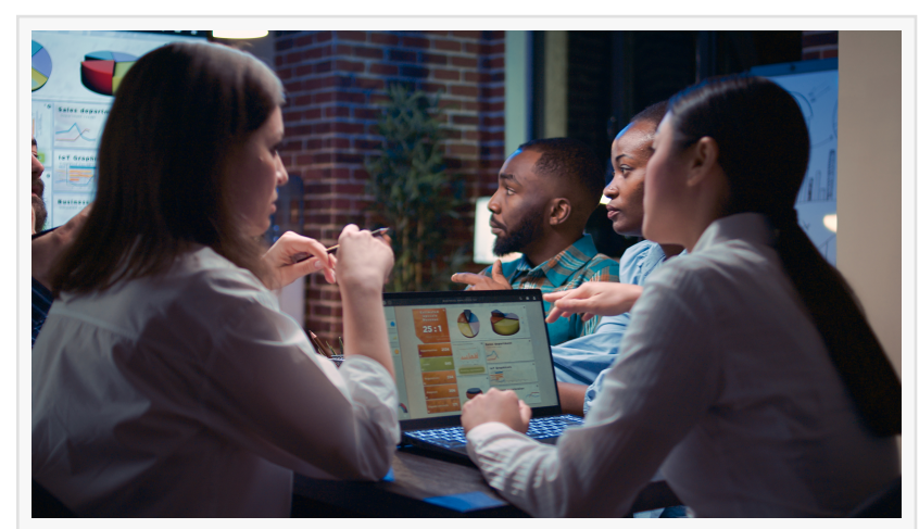
COSMarketing Agency Utilizes LinkedIn

With a focus on high quality, consistency, and attention to detail, COSMarketing Agency understands the importance of utilizing various platforms to connect with a target audience.