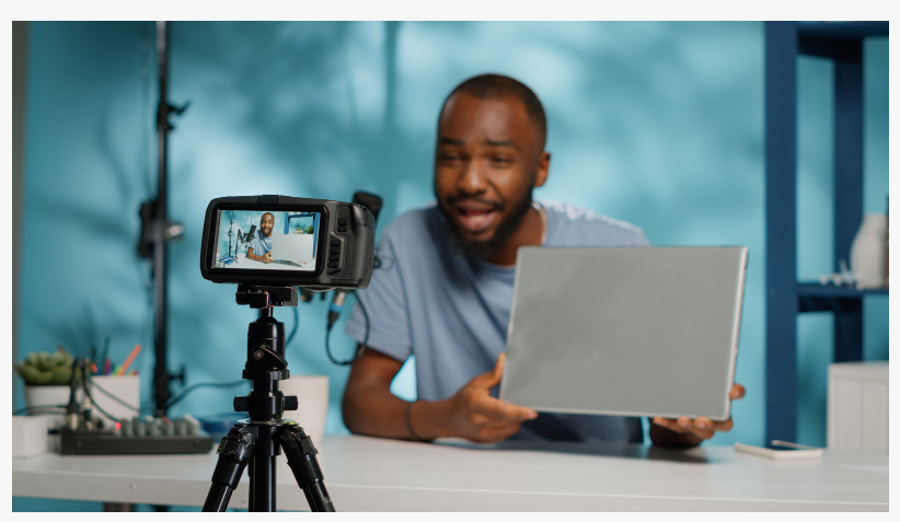
COSMarketing Agency Utilizes YouTube

and engaging videos, COSMarketing helps businesses stand out from the crowd and connect with their customers in a meaningful way.