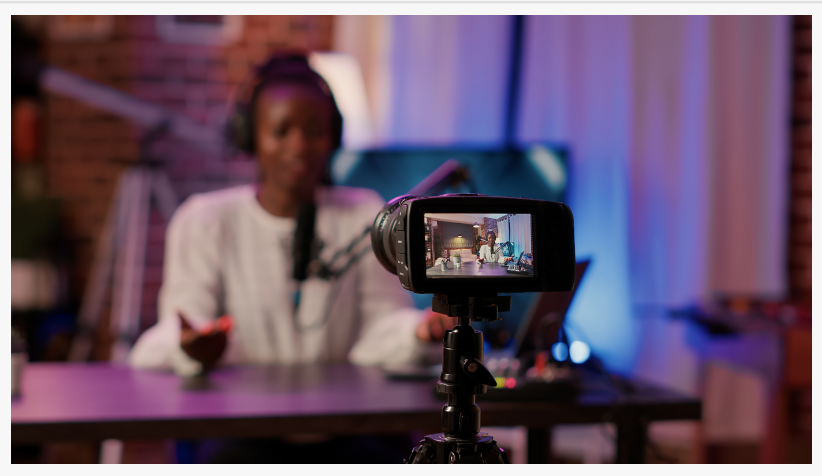
Using YouTube for marketing and advertising

Hiring COSMarketing Agency empowers businesses to focus on what they do best while leaving their YouTube marketing needs in good hands.