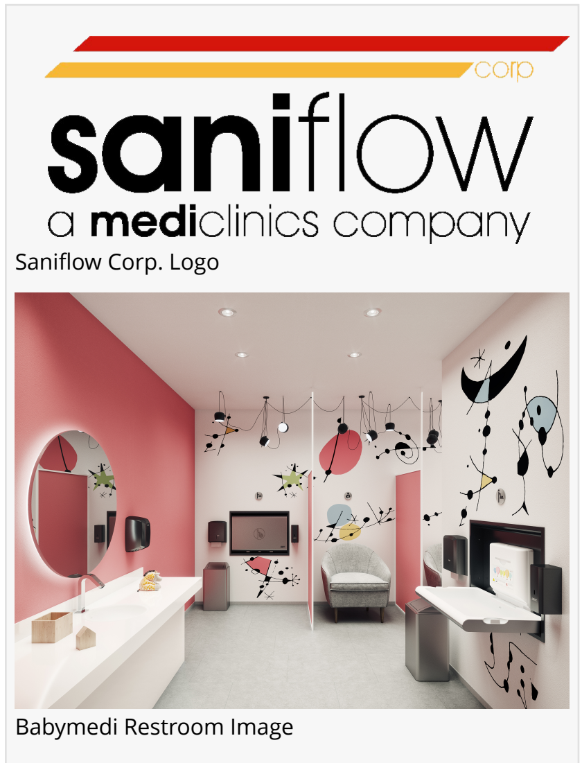
Babymedi Restroom Image

Engineered with this in mind, the BabyMedi® diaper changing stations provide a superior solution for public spaces such as shopping centers, airports, and entertainment facilities. Designed to ensure safety and cleanliness, BabyMedi® stations are crafted from premium materials, easy to clean and maintain, reducing the risk of bacterial contamination. Featuring a