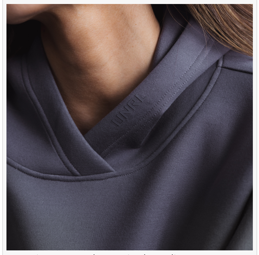
Featuring: LuxBreak Oversized Hoodie

leggings, and a Bomber Jacket are just a few of the products customers can look forward to. Throughout 2024, UNRL plans to release several more women's pieces with a focus on chic golf