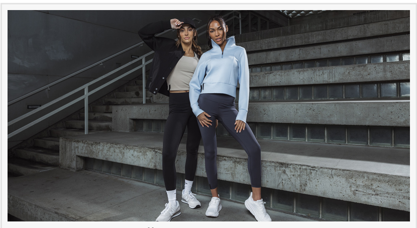
UNRL Women's Collection

The collection will feature a range of practical and timeless pieces designed to elevate women's wardrobes through every season and for any activity. In typical UNRL fashion, branding is subtle and classy with careful attention to detail in every stitch. The styles debuting in the initial launch transition seamlessly from home to the office, the gym, the airport and everywhere in between. Hoodies, pullovers, tank tops,