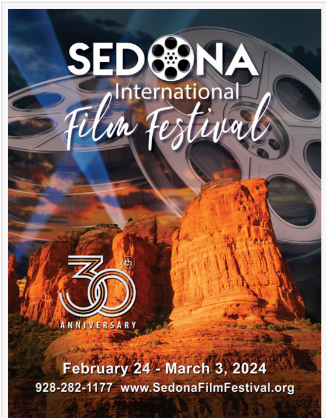
2024 Sedona Film Festival 30th Anniversary

The Sedona Film Festival is all about celebration – it celebrates the filmmakers and it creates celebratory events for attendees, such as a “45th Anniversary Grease Sing-Along” with special guest and honoree, director Randal Kleiser. A free concert will close the festival with “The