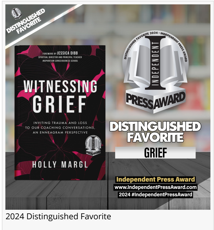
2024 Distinguished Favorite

In 2024, the Independent Press Award saw participation from authors and publishers across the globe, including those residing in Australia, Bangladesh, Canada, Cyprus, Germany, India, Kenya, Japan, Nigeria, Norway, Portugal, Scotland, Singapore, South Africa, Spain, and The Netherlands.