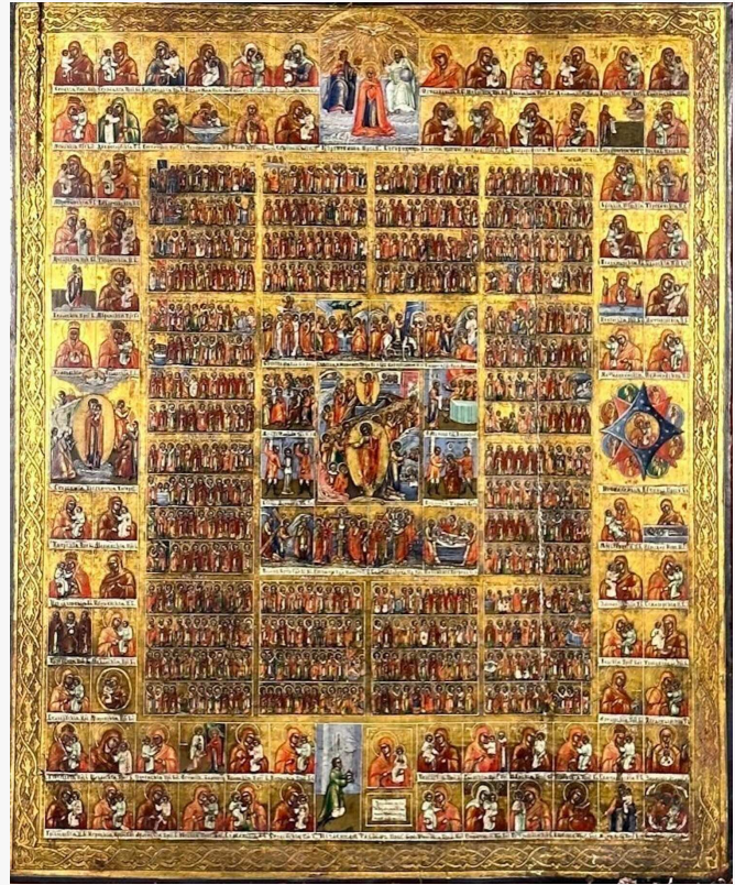
Late 19th century Russian year calendar icon centered by the Resurrection and the calendar for the year with groups of saints, 30 inches by 27 inches, framed (est. $2,000-$4,000).

Decorative accessories will be plentiful, to include a large pair of early 19th century Sevres jeweled covered baluster form vases, each one 23 inches tall and painted with a charming scene, the squared gilt bronze bases engraved "Louis Seize a Marie Antoinette, 1772" (est. ($1,500-$2,500); and a giant size Bisazza Murano blown glass underwater aquarium, titled Immersion I (model 3325), internally decorated with tropical fish, sea horses, jellyfish and plant