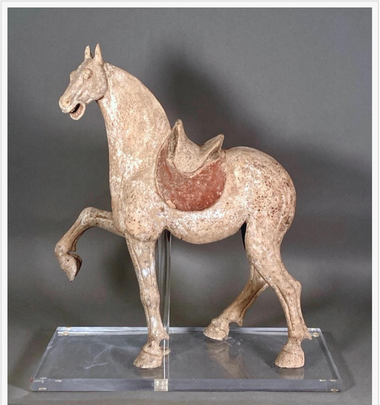
Large-scale Chinese Tang Dynasty (618-907 A.D.) prancing horse, 23 ½ inches tall, the head turned and mouth open, perched on a custom Lucite stand (est. $3,000-$5,000).

Furniture will feature a fine and rare circa 1790 small George III rosewood and satinwood Pembroke table having an oval top with two drop leaves in rosewood, diminutive at 28 ½ inches tall and 12 inches wide (24 inches with leaves extended (est. $3,000-$5,000); and a George Mulhauser for Plycraft Sultana swivel chair with a curved padded back over bentwood scroll arms and circular seat, raised on a tapering pedestal bentwood base (est. $800-$1,200).