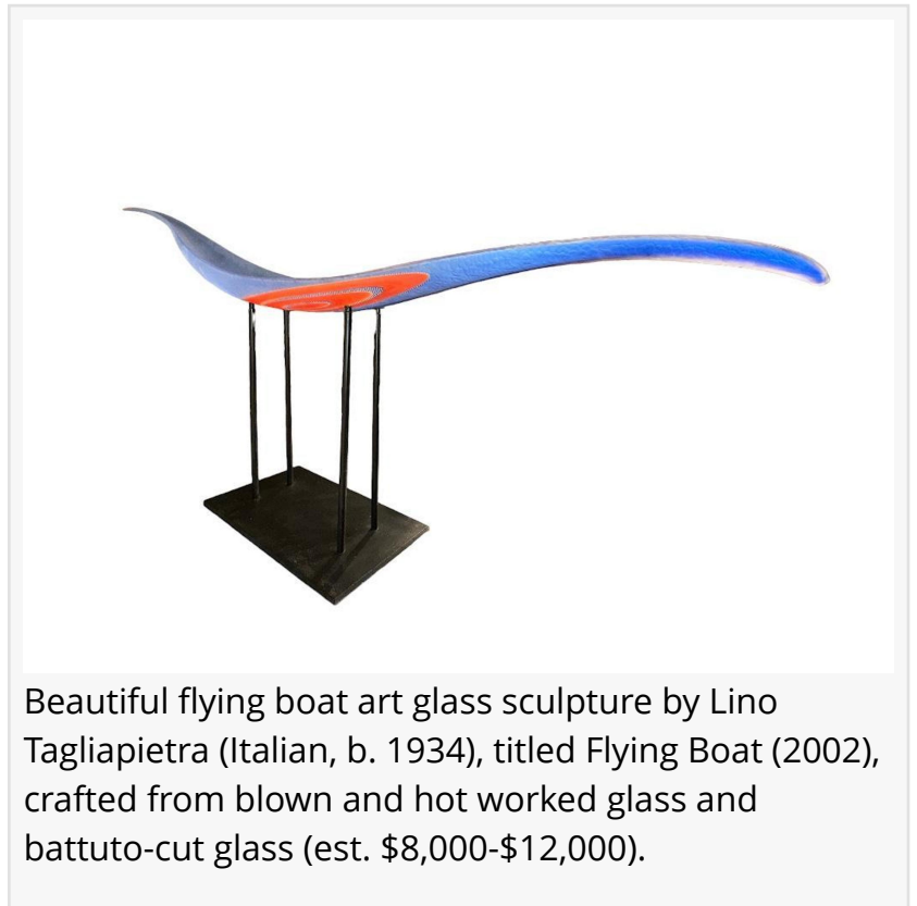
Beautiful flying boat art glass sculpture by Lino Tagliapietra (Italian, b. 1934), titled Flying Boat (2002), crafted from blown and hot worked glass and battuto-cut glass (est. $8,000-$12,000).

The 19th century Russian year calendar icon is centered by the Anastasis (Resurrection) and the