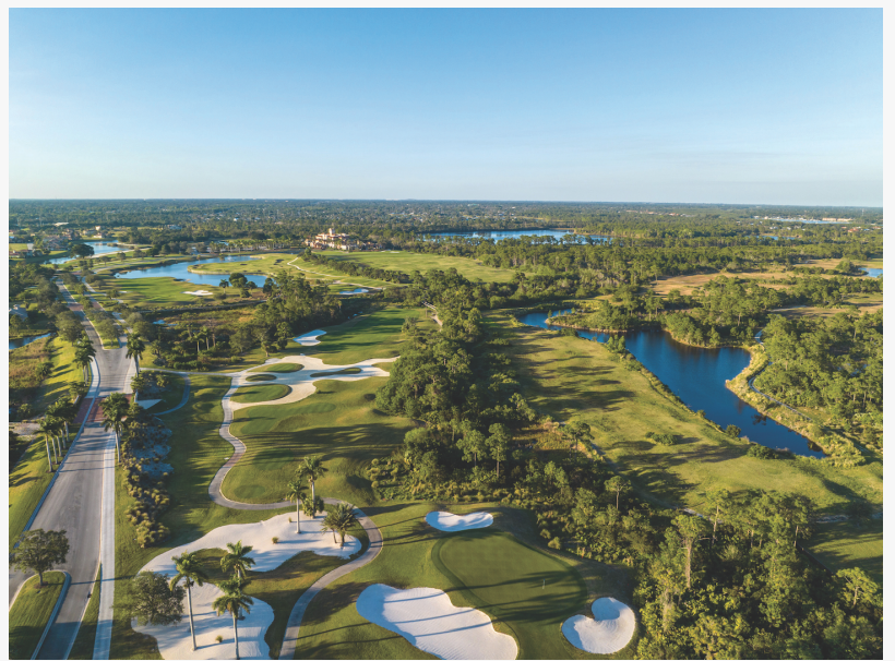
Tesoro Club's Championship Golf Course

Home buyers from throughout the U.S. as well as Palm Beach and Broward counties are flocking to Tesoro Club, which closed out 2023 with more than 80 home sales, exceeding its projections. The home sales are driven by the world-class golf, as well as its array of signature and luxury homes, and numerous amenities.