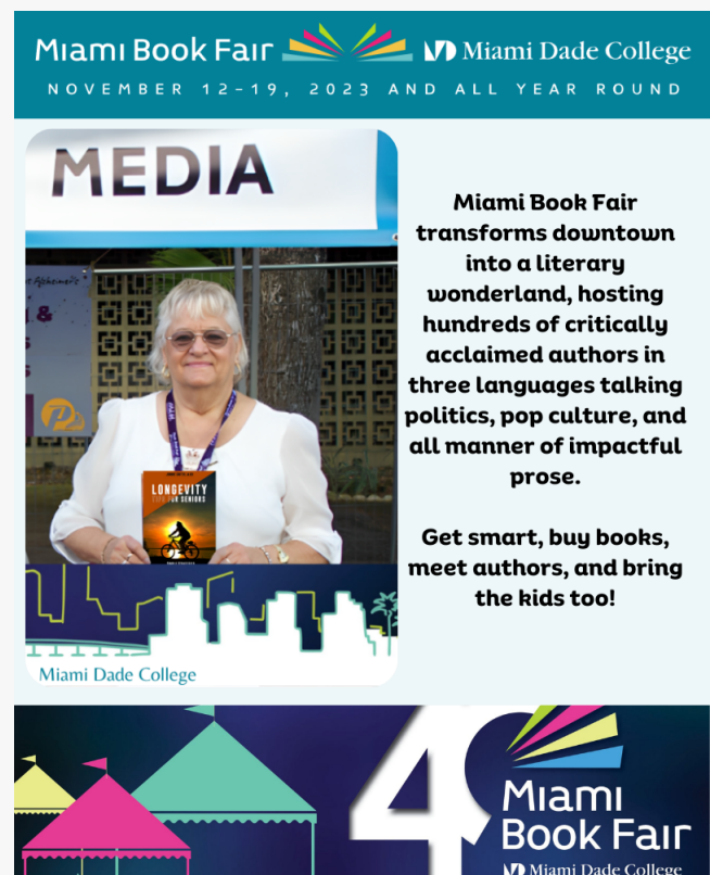
Miami Book Fair 2023