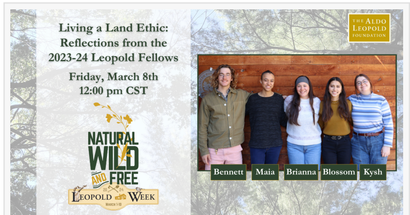
Aldo Leopold Foundation Fellows

Wisconsin Department of Natural Resources – Division of Forestry