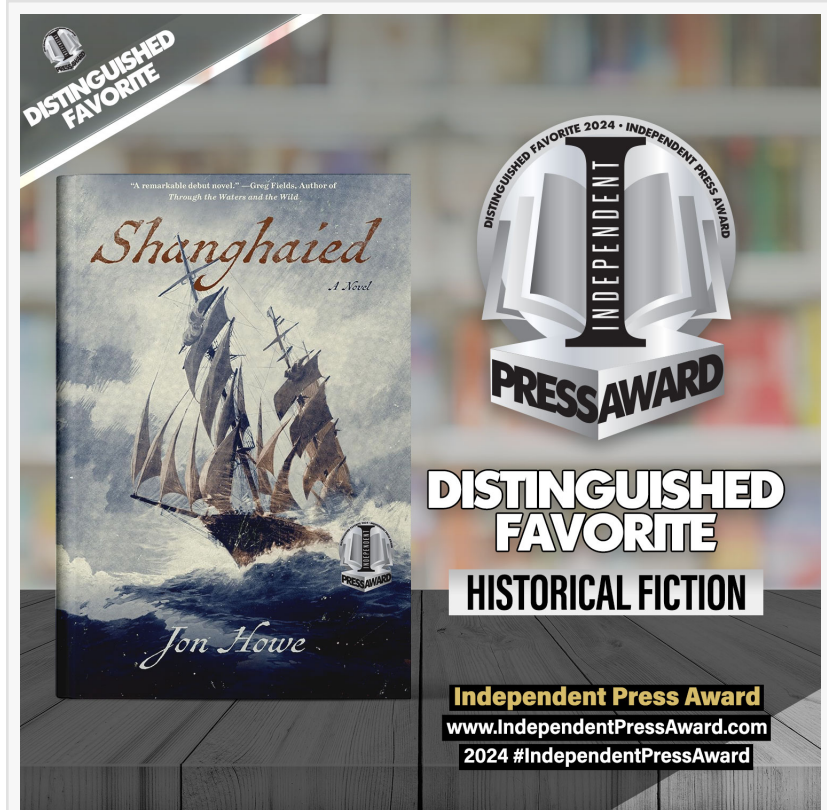
2024 Distinguished Favorite