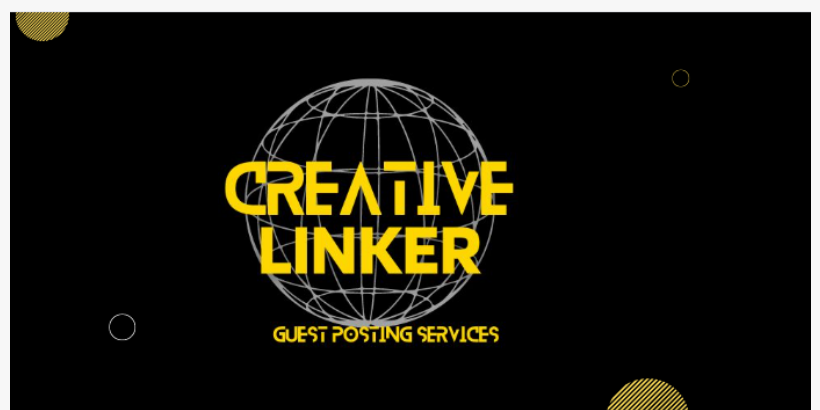
Creative Linker Cover

Creative Linker understands the nuanced aspects of successful guest posting and offers a comprehensive service that goes beyond simply securing placements. The company's approach focuses on delivering exceptional value to both businesses and partnering websites, fostering mutually beneficial partnerships.