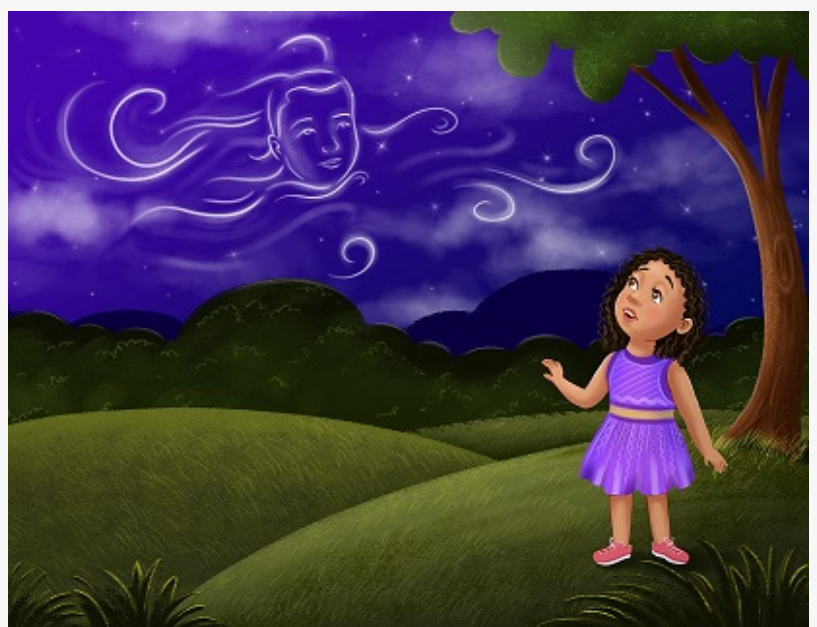
Daddy's Love Is Always Near