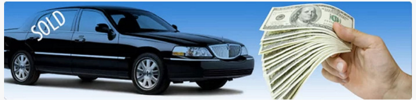
sell my lamborghini