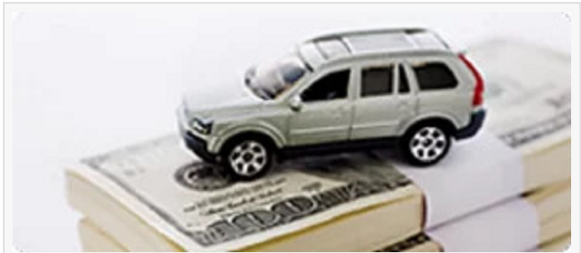
sell my honda