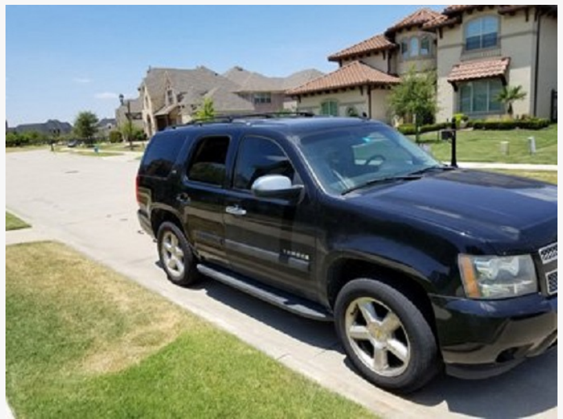
sell exotic car

In response to growing demand, Top Cash For Cars DFW is expanding its reach within Garland, TX, and surrounding areas. This expansion means more car owners can take advantage of the exceptional car selling services offered by Top Cash For Cars DFW. Whether you're selling a single car or a fleet, the company's expanded services ensure that more customers can enjoy the benefits of a hassle-free sale.