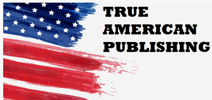
True American Publishing