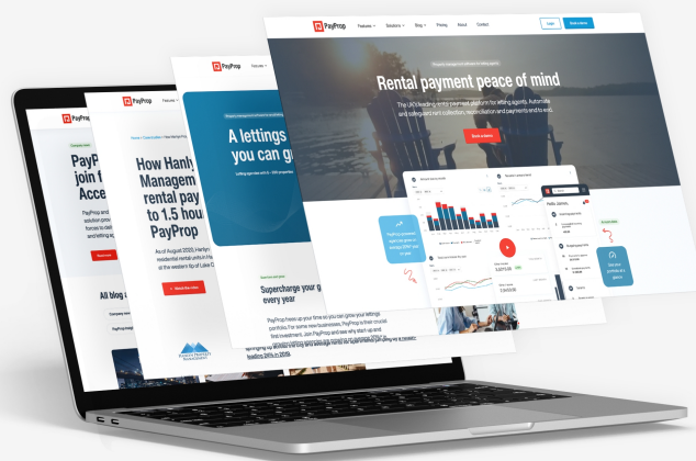
PayProp's newly redesigned website, for a fresh, engaging, informative online experience