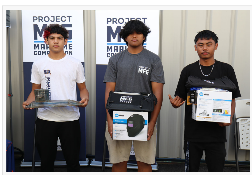
Project MFG Maritime Weilding winners

HONOLULU, HI, USA, February 26, 2024 /EINPresswire.com/ -- Project MFG partnered with the Pacific Shipyard International, Department of Defense, and U.S. Navy, to host the Project MFG Hawaii Maritime Welding Competition and Career Discovery Day at the Pacific Shipyard International in Honolulu, Hawaii. On February 23, 2024, high