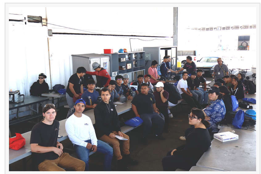
Project MFG Maritime Weilding Competition invited students from Hilo High School, Waipahu High School and Kapaa High School

The Project MFG Hawaii Welding Competition featured three schools - Waipahu High School, Hilo High School, and Kapaa High School and consisted of 20 competitors. Students raced against the clock to finish a challenge that tested on skills required for shipbuilding while competing in a working shipyard. Once completed the projects were judged and the top three scores were announced. The winners of Hawaii Maritime Welding Competition were: