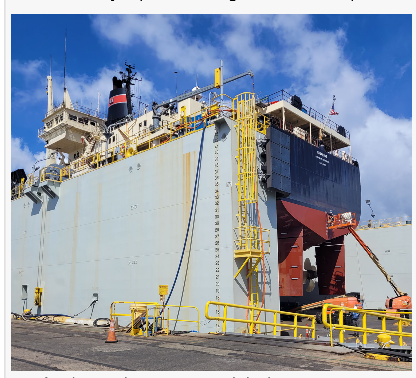
Pacific Shipyards International dock tour

This press release can be viewed online at: https://www.einpresswire.com/article/691424240 EIN Presswire's priority is source transparency. We do not allow opaque clients, and our editors