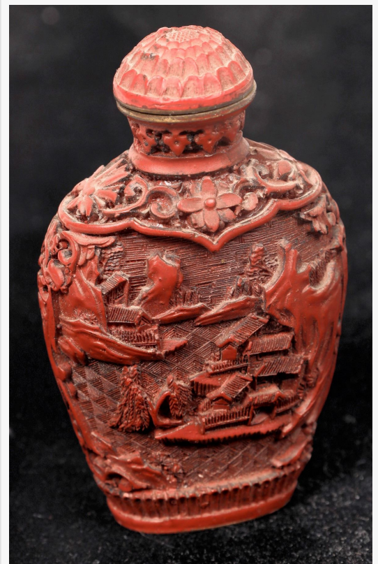
Circa 1780-1880 original carved Chinese cinnabar lacquer snuff bottle that came out of the Hotel House in Tombstone, Arizona in 1882, about 2 ½ inches tall (est. $500-$1,000).

Anyone owning a collection that might fit into a Holabird Western Americana Collections auction