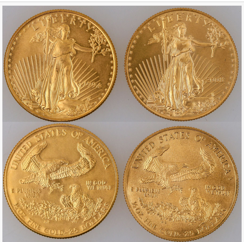
Pair of U.S. $25 Gold Eagle mint state coins, one from 1994 and the other 2008, both containing one-half ounce of fine gold (est. $3,000-$5,000).

Also up for bid will be by fraternal organizations, firefighting memorabilia, ephemera (sorted by geography), musical and entertainment, sports, photography, World's Fair and Expositions, antique maps, toys, books, numismatics, tokens and medals, ingots, minerals, mining and mining stocks. Altogether, 776 lots will be sold to the highest bidder, with each lot starting at just $10.