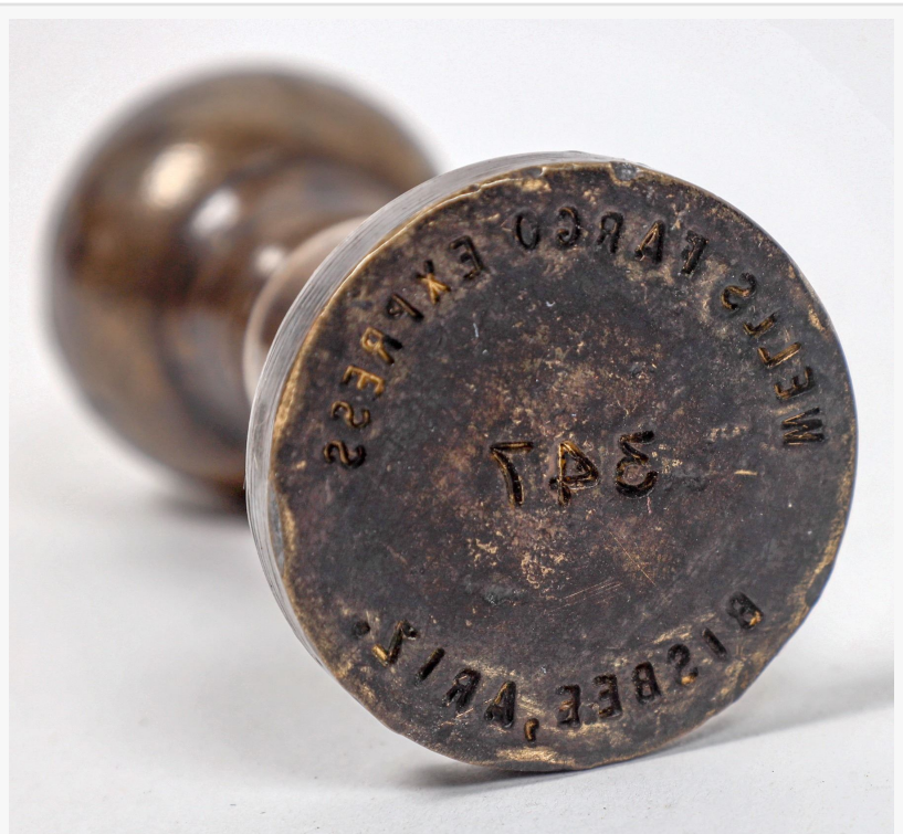
Facsimile brass Wells Fargo Express cancellation stamp (Bisbee, Ariz.), 3 inches in length, would say "Wells, Fargo & Co.'s Express" if genuine (est. $300-$500).

This press release can be viewed online at: https://www.einpresswire.com/article/691457701