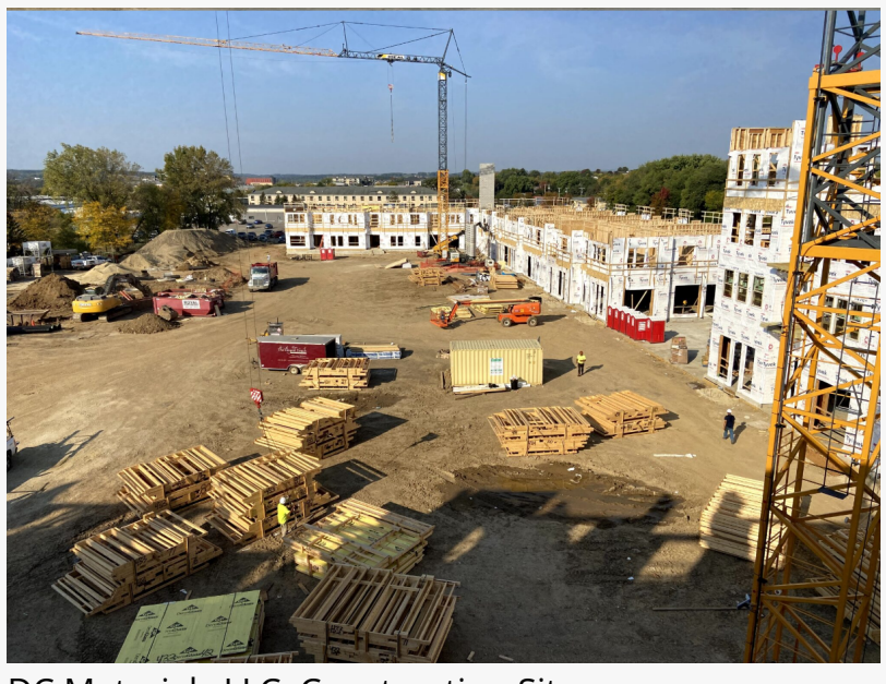
DC Materials LLC. Construction Site

This press release can be viewed online at: https://www.einpresswire.com/article/691479399