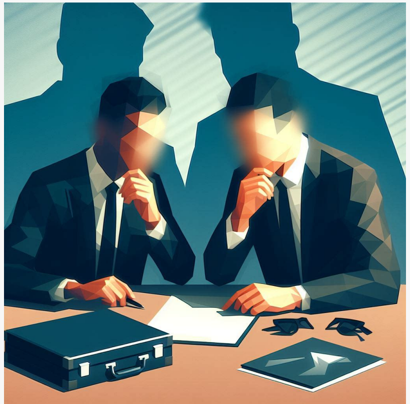
Amicus International Consulting