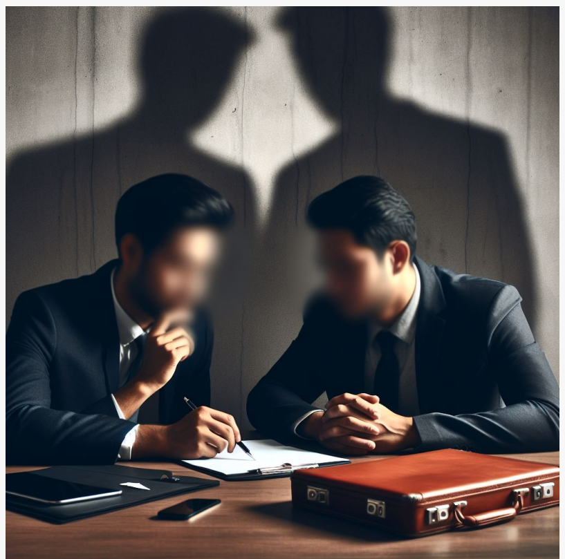
Amicus International Consulting