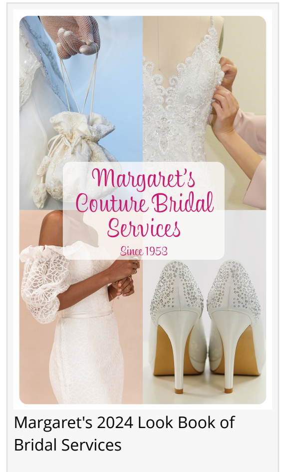
Margaret's 2024 Look Book of Bridal Services