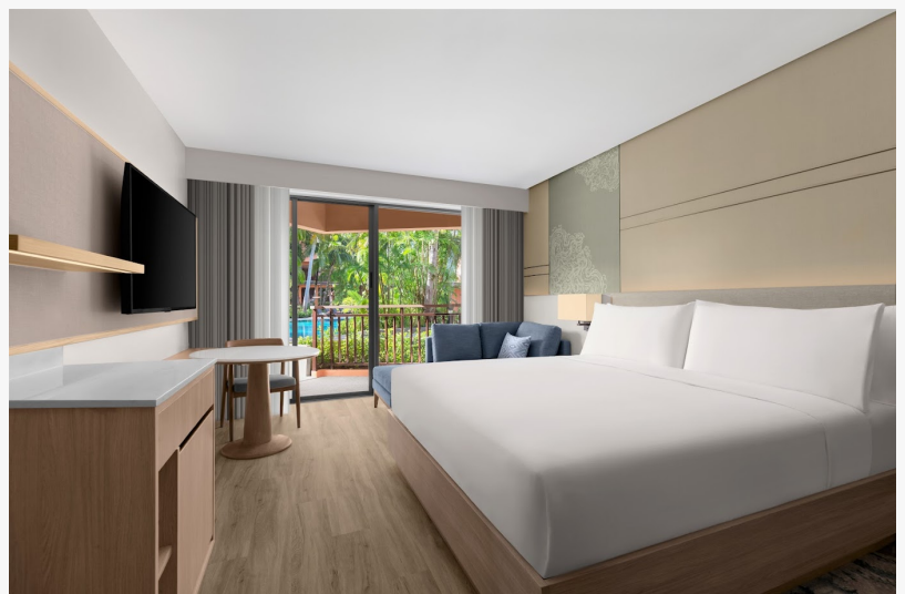
The hotel features 300 guestrooms in its opening phase, before rising to 445 keys in Q4/2024