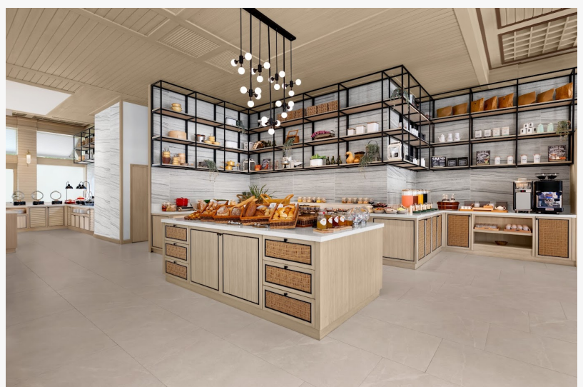
The Phuket Eatery is an all-day dining destination for every culinary occasion, from business lunches to family dinners

Event planners can explore three dynamic meeting spaces, including the brand-new Merlin Ballroom with high ceilings, design elements inspired by Phuket's local culture, and a dedicated