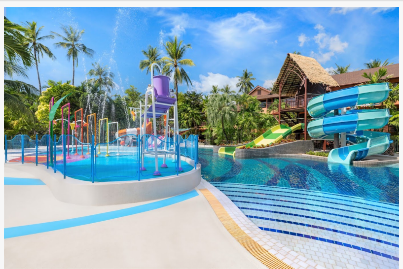
All ages can make a splash in the interactive and family-friendly Fun Pool