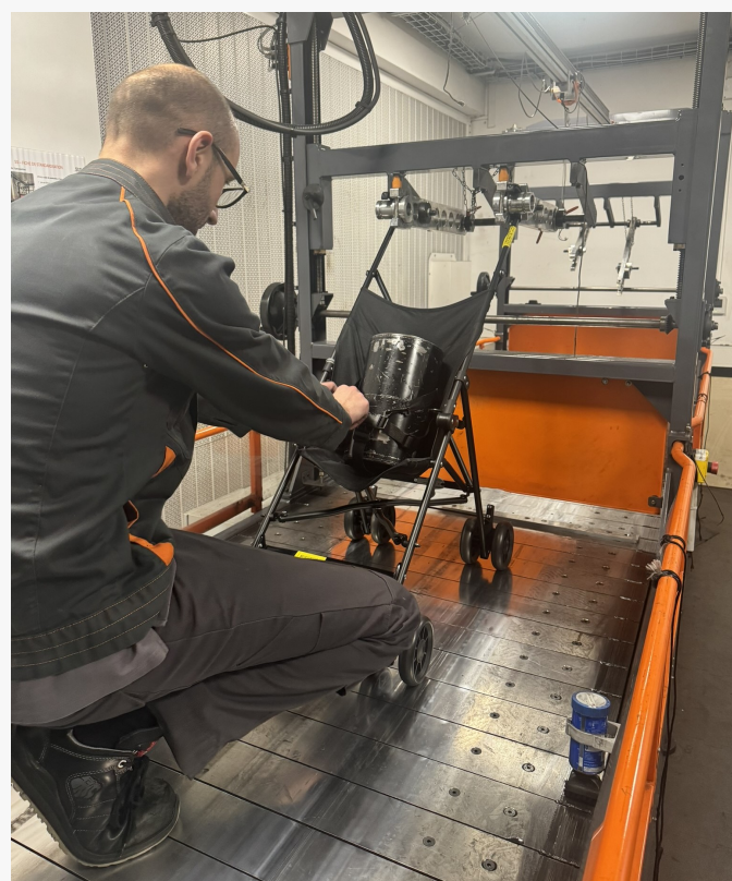
Installation of a stroller on Irregular Surface Test equipment at Aix en Provence

This press release can be viewed online at: https://www.einpresswire.com/article/691678789