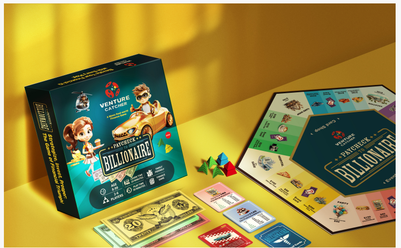
Paycheck to Billionaire, the challenger to Monopoly

PHILADELPHIA, PA, UNITED STATES, February 27, 2024 /EINPresswire.com/ -- Venture Catcher Studio has announced the launch of " Paycheck to Billionaire ," a novel board game designed to provide players with a realistic experience of financial management, investment, and entrepreneurship. Moving away from traditional themes of monopolization and property acquisition, this game introduces a narrative centered on achieving financial success through strategic decision-making and real-world financial literacy.