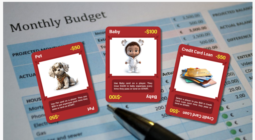
What is the key to handle recurring cost?