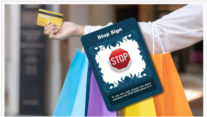
Make your customers stop for your venture

"Paycheck to Billionaire" invites players to explore the complexities of financial success through a lens of strategic gameplay and financial education, marking a new era in board games that prioritize real-world applicability and strategic depth.