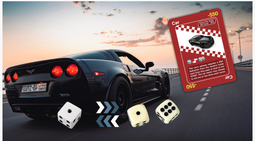
Investing in a car brings you more flexibility