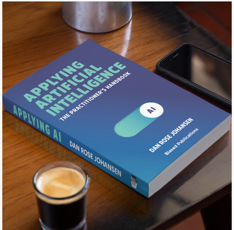
Applying Artificial Intelligence - The Practitioner's Handbook