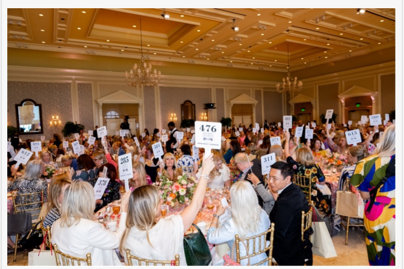
Atmosphere

Nonprofits First for Excellence in Nonprofit Management. For more information, please visit I: @cfspbc | F: centerforfamilyservicespbc | X / T: @Center4FS