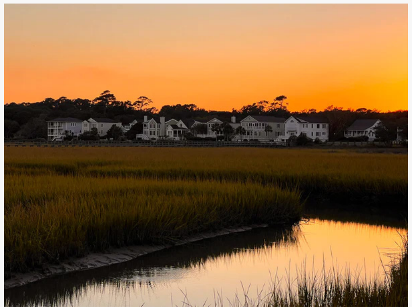
Oak Lea Creek Side

Situated in the heart of Pawleys Island, SC, the Oak Lea Community is renowned for its luxurious amenities, including a private dock, community pool, and various sports courts, all set within the stunning landscape of The Grand Strand. It offers a lifestyle marked by luxury, security, and the untouched beauty of the coast, making it a highly sought-after location for homebuyers.