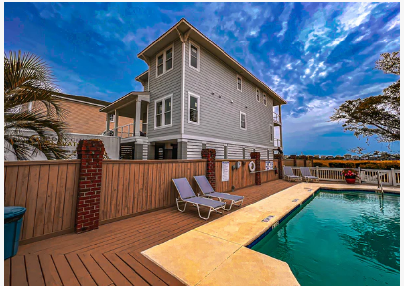
Pawleys Island Beach Home

PAWLEYS ISLAND, SOUTH CAROLINA, USA, February 27, 2024 /EINPresswire.com/ -- A jewel of Pawleys Island, 283 Berry Tree Drive , is now on the market for $1.79M. This home is not just a residence but a celebration of coastal living at its finest, set within the prestigious Oak Lea Community. Its breathtaking views have earned it regular features on WPDE and a coveted spot on the 2024 WPDE Calendar, signifying its exceptional beauty and the unique lifestyle it offers.