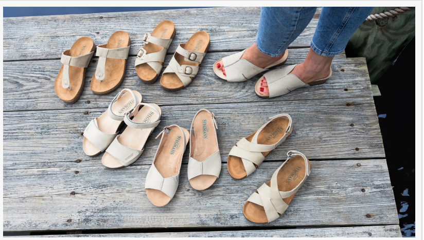
Stegmann introduced a new color to its existing sandal line Ecru, a soft natural white leather designed to style effortlessly with light spring and summer outfits.

"As we continue to innovate and expand options based on our customer feedback, it's important for