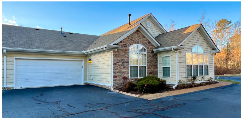
7395 Norwood Pond Place, Midlothian, VA 23112