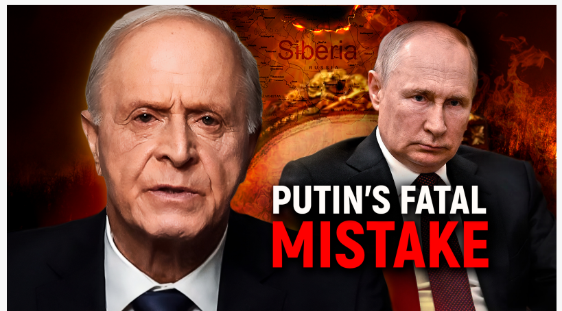
Putin's Fatal Mistake. Russia is Doomed. American Scientist Exposes Facts of Russia's Collapse

“Given the increasing trend that has started to manifest, natural disasters will become more