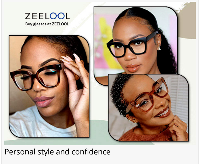
Personal style and confidence