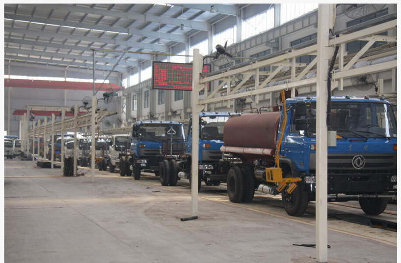
Truck Product Line