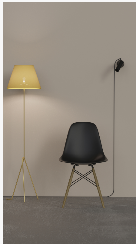
PAUZ at Home

This press release can be viewed online at: https://www.einpresswire.com/article/691917105