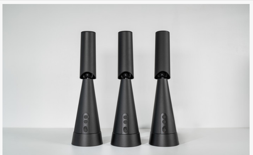
IF Design Award 2023