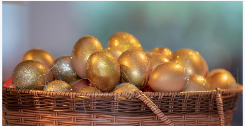
Easter eggs at Kandima Maldives