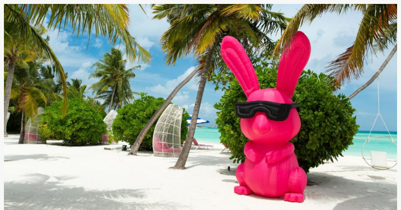
Easter at Kandima Maldives

For those inclined towards athleticism, Kandima provides state-of-the-art fitness amenities,