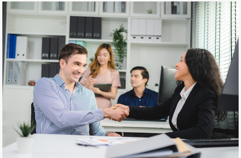
Strategic Human Resources & Innovations HR Solutions