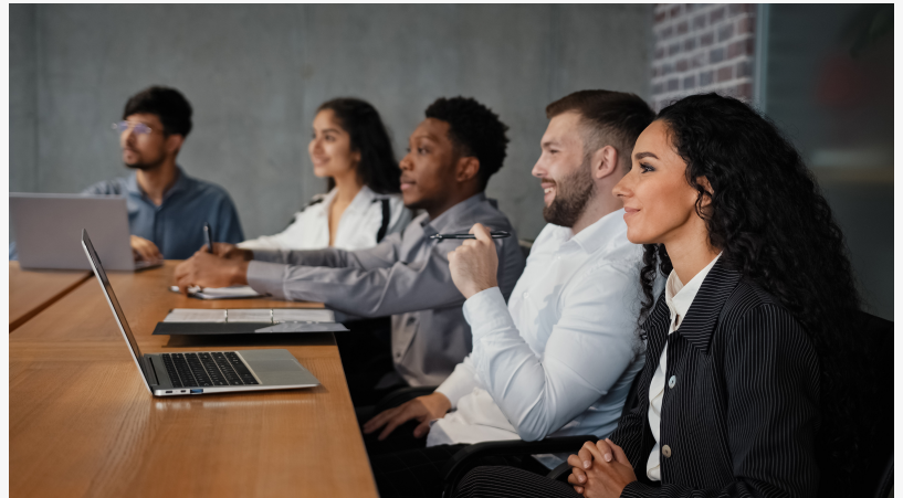
Strategic Human Resources & Innovations save time and money