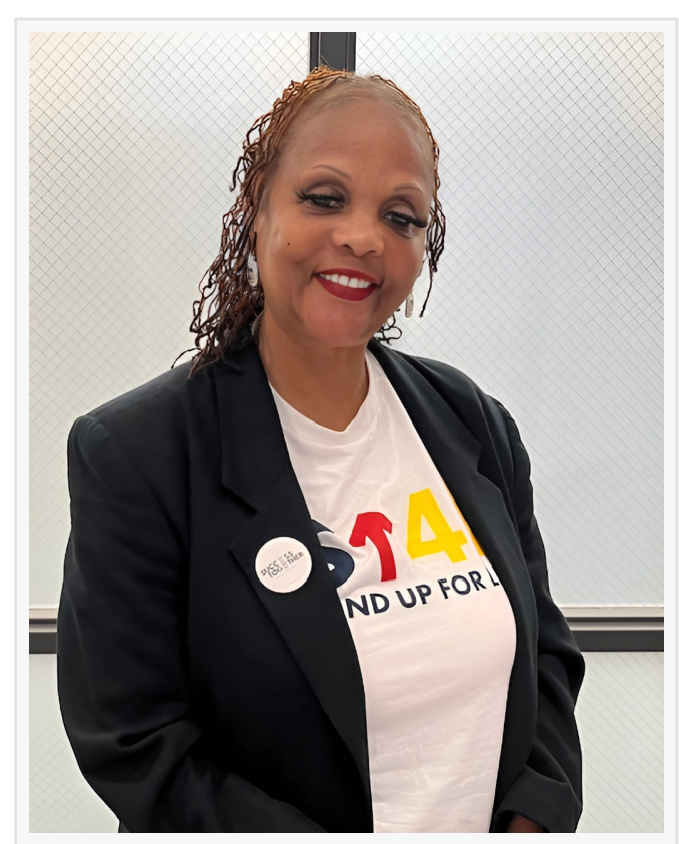
2023 Syncis Life Insurance Convention Las Vegas | F & G partnered with Syncis insurance provider | Wearing "Stand up for life" is about living, not just death.

This press release can be viewed online at: https://www.einpresswire.com/article/692068239