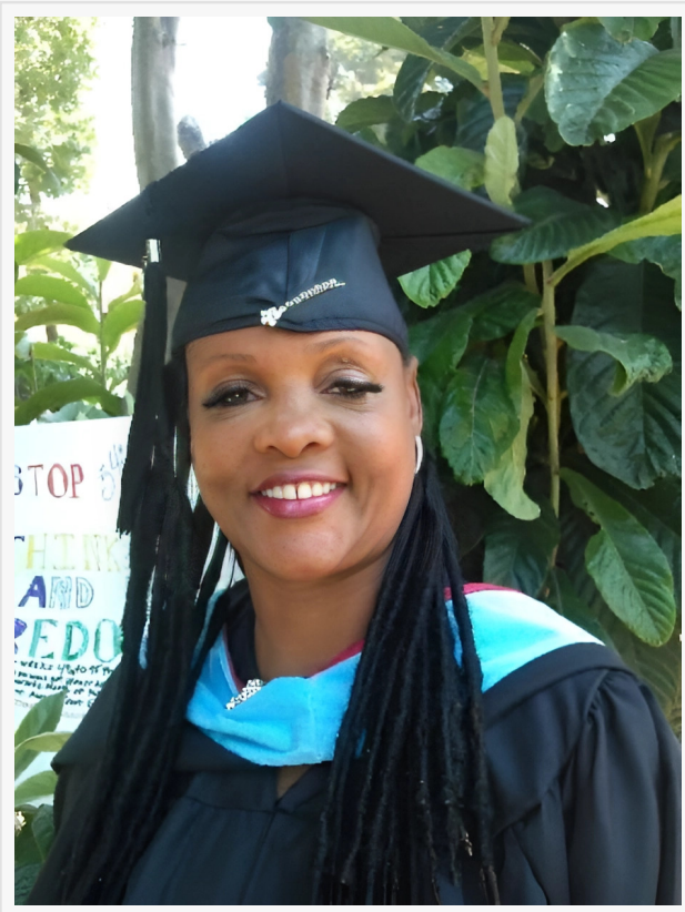
Graduated in 2014 Masters in Marriage & Family Therapy University of Phoenix REDO Therapy Model

"My Love Was Blind", is a good read for anyone interested in self-help and non-fiction books. It explores the raw and honest portrayal of the author's experiences, offering valuable lessons for anyone seeking to heal from past hurts and generational trauma. Move forward with your unfinished faith and become intentional about focusing on the right things with the confidence that faith and beauty will emanate all around you. As hope is a choice and forgiveness is a daily sacrifice, but it is freedom.