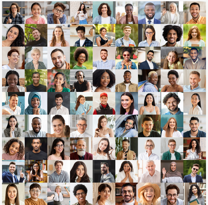
Strategic Human Resources & Innovations for Your Business