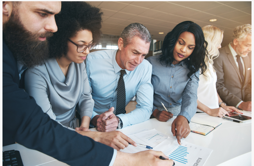
Strategic Human Resources & Innovations Defines Company Culture