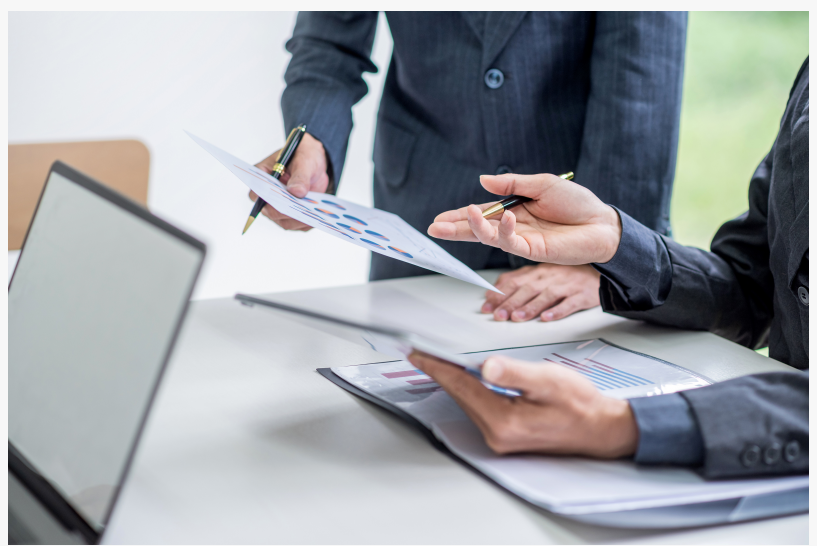
Strategic Human Resources & Innovations Can Help

Sustainability is another core value at the heart of Strategic Human Resources & Innovations'