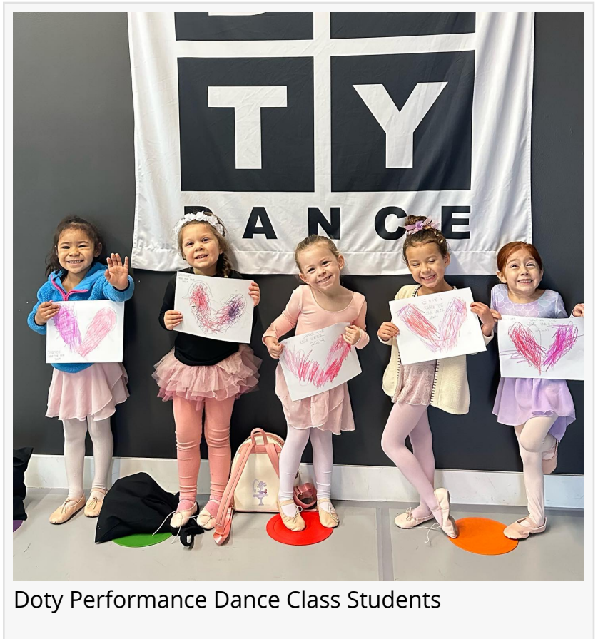
Doty Performance Dance Class Students

This press release can be viewed online at: https://www.einpresswire.com/article/692089069