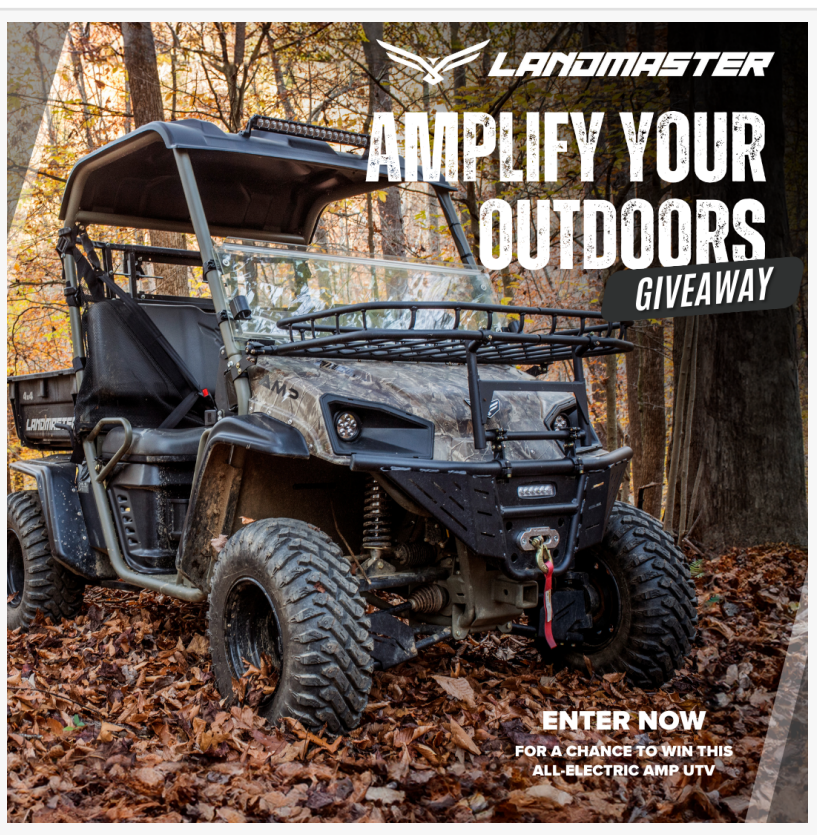
Landmaster AMP 4x4 UTV Giveaway

About AMP: AMP was designed from the ground up to provide an incredible all-electric experience! From its gasequivalent torque, payload, and towing