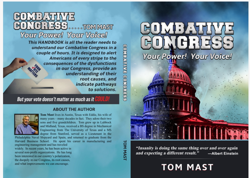
The Combative Congress book