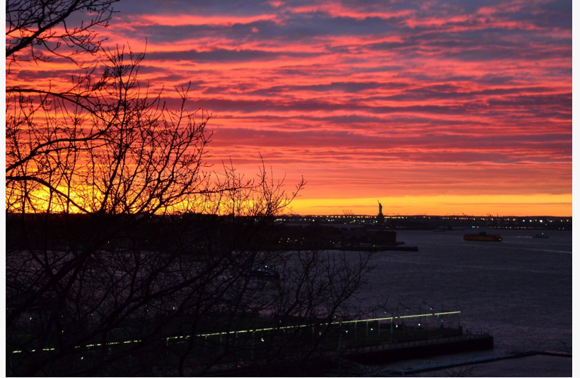
The Statue of Liberty

This press release can be viewed online at: https://www.einpresswire.com/article/692105404