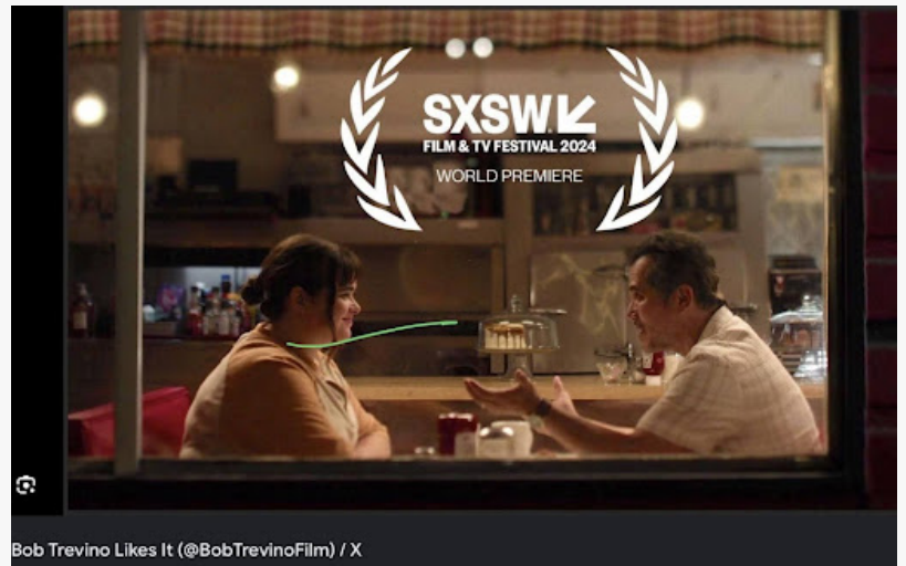
"Bob Trevino Likes It"