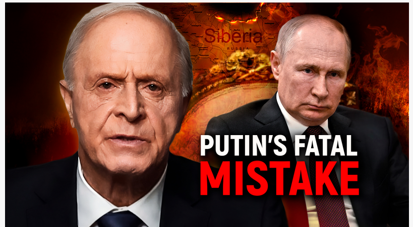
Putin's Fatal Mistake. Russia is Doomed. American Scientist Exposes Facts of Russia's Collapse