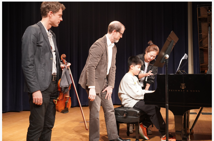
GS Chamber Music Festival