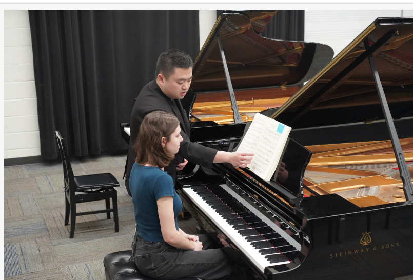
GS Chamber Music Festival

The second edition of the GS Chamber Music Festival not only provided a platform for young musicians to hone their skills but also served as a bridge between cultures, promoting understanding and unity through the art of music. As the festival continues to grow, it promises to offer even more opportunities for artists to excel and connect with their peers from around the world.