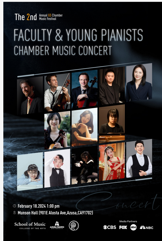
GS Chamber Music Festival