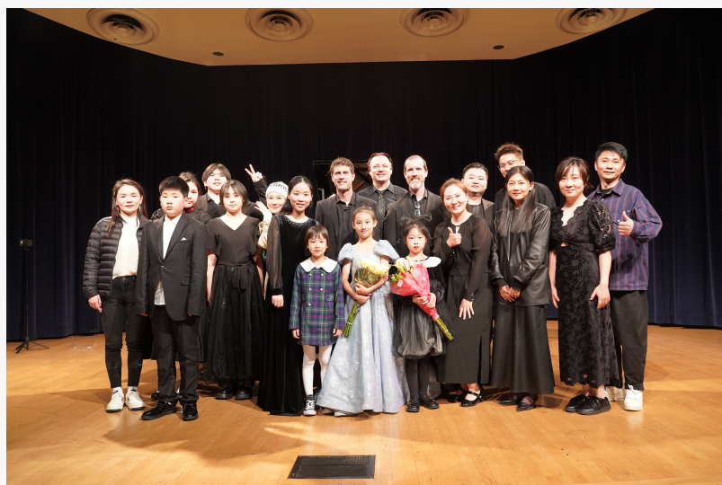
GS Chamber Music Festival